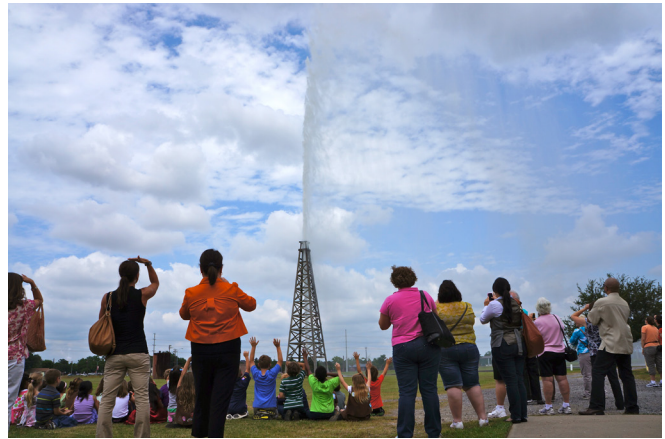
Photos: Left, the oil field's Boiler Avenue, April 23, 1903; Above, excitement at Spindletop/Gladys City

historic properties and assess the effects of the projects they carry out, fund, or permit on these properties. Federal agencies also are required to consult with parties that have an interest in the fate of the property when adverse effects are likely to ensue.