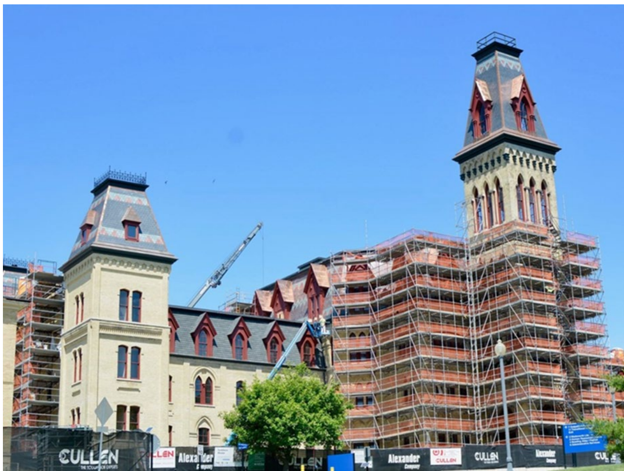
Figure 9: Milwaukee VAMC's Old Main during rehabilitation.

The Milwaukee Soldiers Home welcomed its first residents in March 2021 after an 18-month renovation project, which was the culmination of a 10-year effort to save several historic buildings and return them to their original purpose – serving Veterans. This EUL project, which involves the adaptive reuse of six historic buildings on the campus into 101 housing units for homeless and at-risk Veterans and their families, was also awarded a $500,000 Save America's Treasures grant from the National Park Service