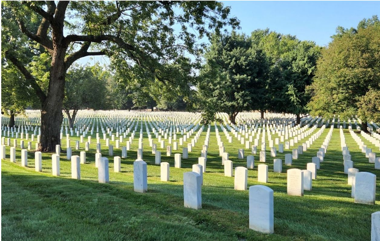
Figure 6: Headstones in Zachary Taylor National Cemetery (KY).

During the reporting period, NCA partnered with USACE St Louis District under an Interagency Agreement to undertake the rehabilitation of 15 historic cemetery caretaker's lodges. USACE utilized an existing contract to use local preservation architects who meet the SOI Professional Qualifications. In addition, USACE used an existing contract to provide professional services for the historic caretaker lodges. These preservation architects are updating Historic Structures Assessment Reports (HSARs) and reviewing VA Facility Condition Assessments (FCA) to identify deficiencies. The preservation architects are then preparing plans, specifications, and cost estimates for the rehabilitation. USACE will assist NCA with contracting for the construction phase. The following is a status