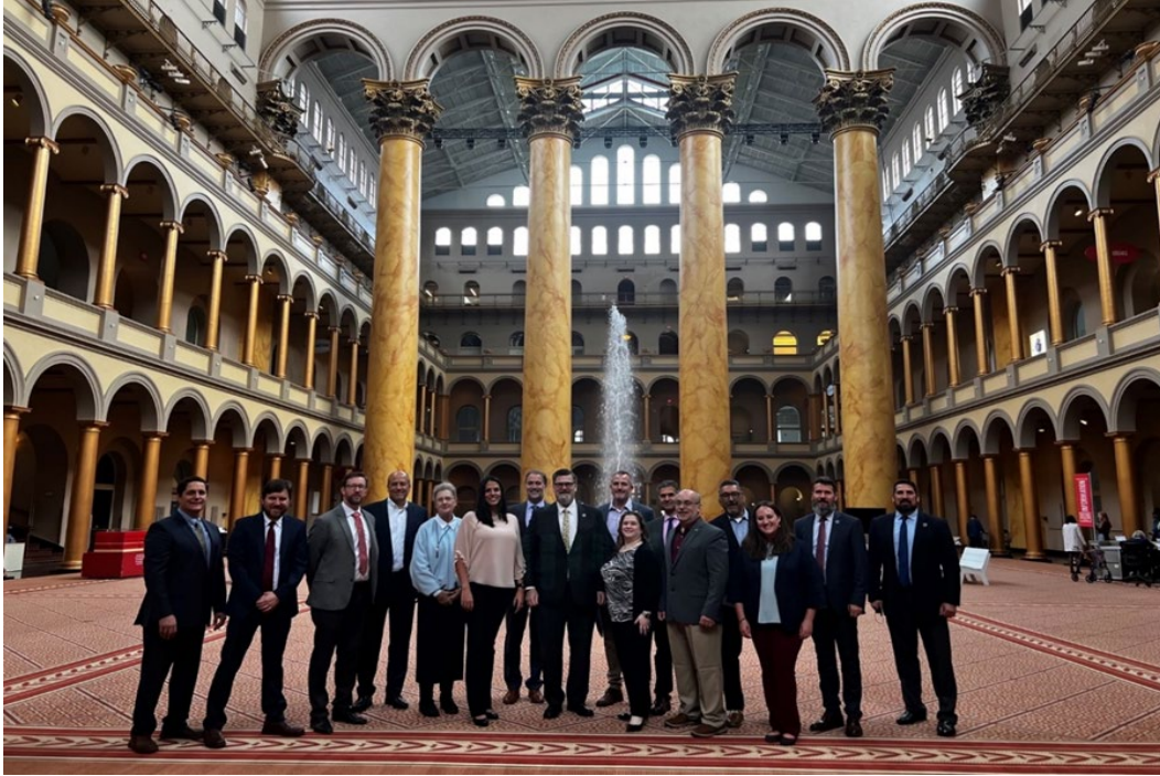
Figure 13: CFM leadership and HPO staff at the National Building Museum, formerly the Old Pension Office.

VA has continued its partnership with the ACHP, sponsoring a liaison program analyst position since 2010. The VA liaison assists VA in compliance with Section 106 consultations, and in VA's responsibilities as a member of the ACHP.