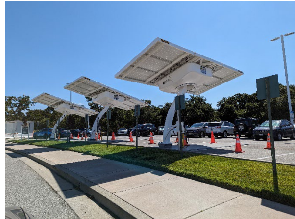
Figure 4: EV charging stations at the Palo Alto (CA) VAMC.

electric vehicle supply equipment (EVSE) on historic properties. VA has utilized this exemption on approximately 40 VHA facilities to place approximately 140 temporary, free-standing, mobile EVSE units in parking areas, allowing for a more streamlined rollout of efforts to focus on clean energy and infrastructure.