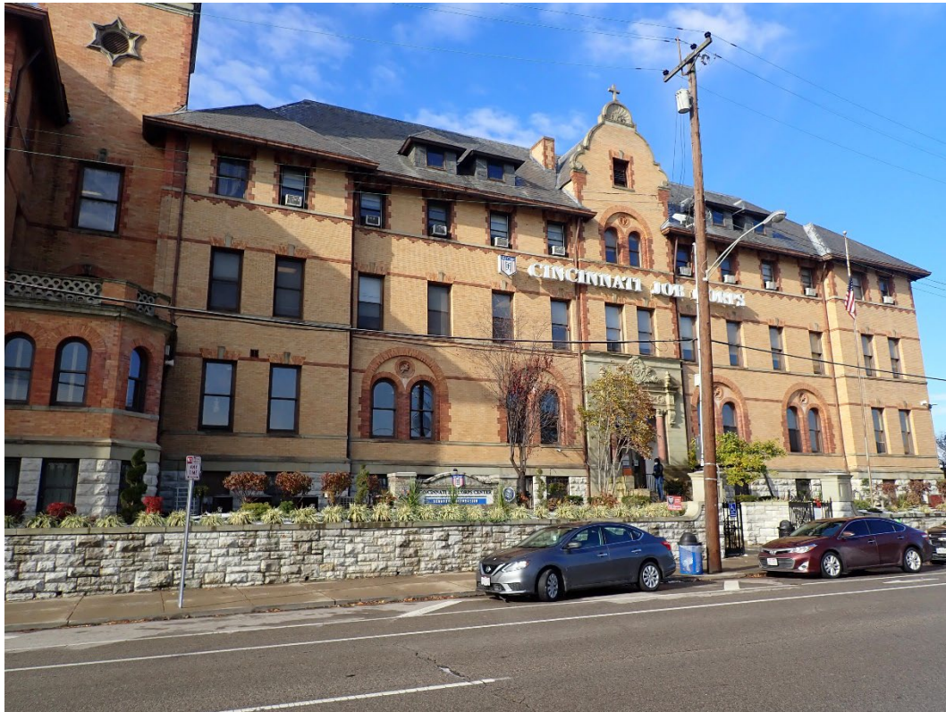
Cincinnati Job Corps Center: 1409 Western Avenue, Cincinnati, OH 45214. Built 1897