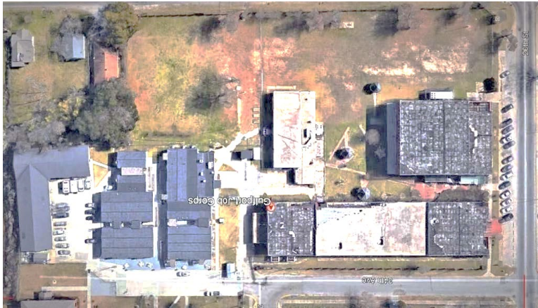
Pre-construction view from Google Earth

as an invited signatory. DOL design follows the MOA stipulations to maximize the rehabilitation of the historic buildings. The MOA stipulates that DOL perform a re-evaluation of the 33 rd Avenue School once the redevelopment project is completed to determine if the historic buildings remain eligible for listing on the NHRP. The design for the new construction includes measures to address the climate challenges in the Gulfport region. Structural systems, building roofs and windows are all designed to sustain hurricane level winds. The site features minimize impervious surfaces and optimize stormwater drainage. All these, contribute to the protection of new and old buildings against the harsh elements of the local climate.