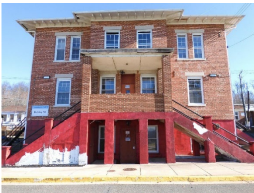
Truman Hall Building 8, was determined to be eligible for listing on the NRHP. West elevations, looking east.