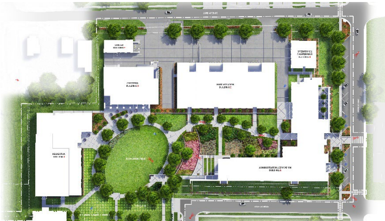
Redevelopment plan. Construction is underway.