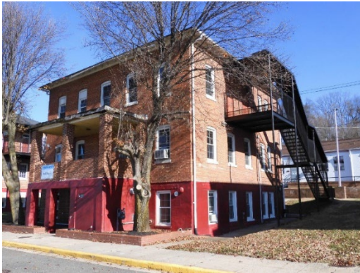
F. D. Roosevelt Hall Building 9, was determined to be eligible for listing on the NRHP. View of south and west elevations, looking northeast.