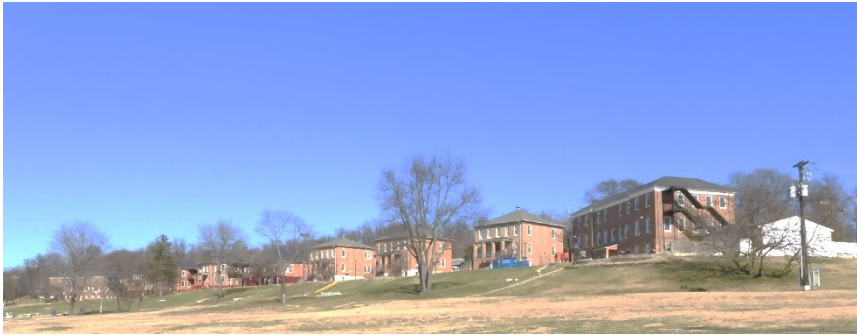
Buildings 7 through 15 (from left to right) built for the former Industrial Home School for Colored Children (IHSCC) at the Potomac Job Corps Center. The buildings are raised on a slight hill with the lower green commons in the foreground.