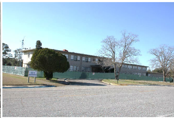
Administration Building 1604, dated 2023.