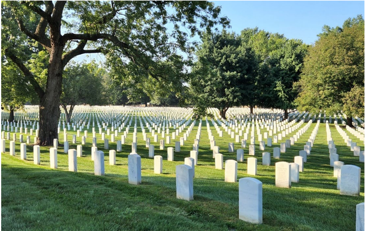
Figure 6: Headstones in Zachary Taylor National Cemetery (KY).

During the reporting period, NCA partnered with USACE St Louis District under an Interagency Agreement to undertake the rehabilitation of 15 historic cemetery caretaker’s lodges. USACE utilized an existing contract to use local preservation architects who meet the SOI Professional Qualifications. In addition, USACE used an existing contract to provide professional services for the historic caretaker lodges. These preservation architects are updating Historic Structures Assessment Reports (HSARs) and reviewing VA Facility Condition Assessments (FCA) to identify deficiencies. The preservation architects are then preparing plans, specifications, and cost estimates for the rehabilitation. USACE will assist NCA with contracting for the construction phase. The following is a status