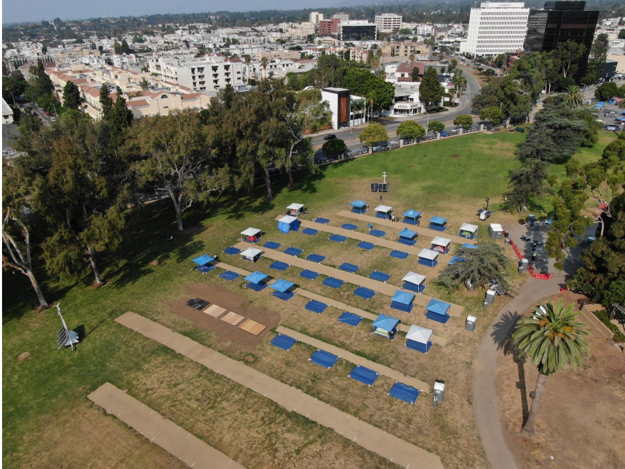
Figure 3: CTRS site on the West Los Angeles VAMC campus.