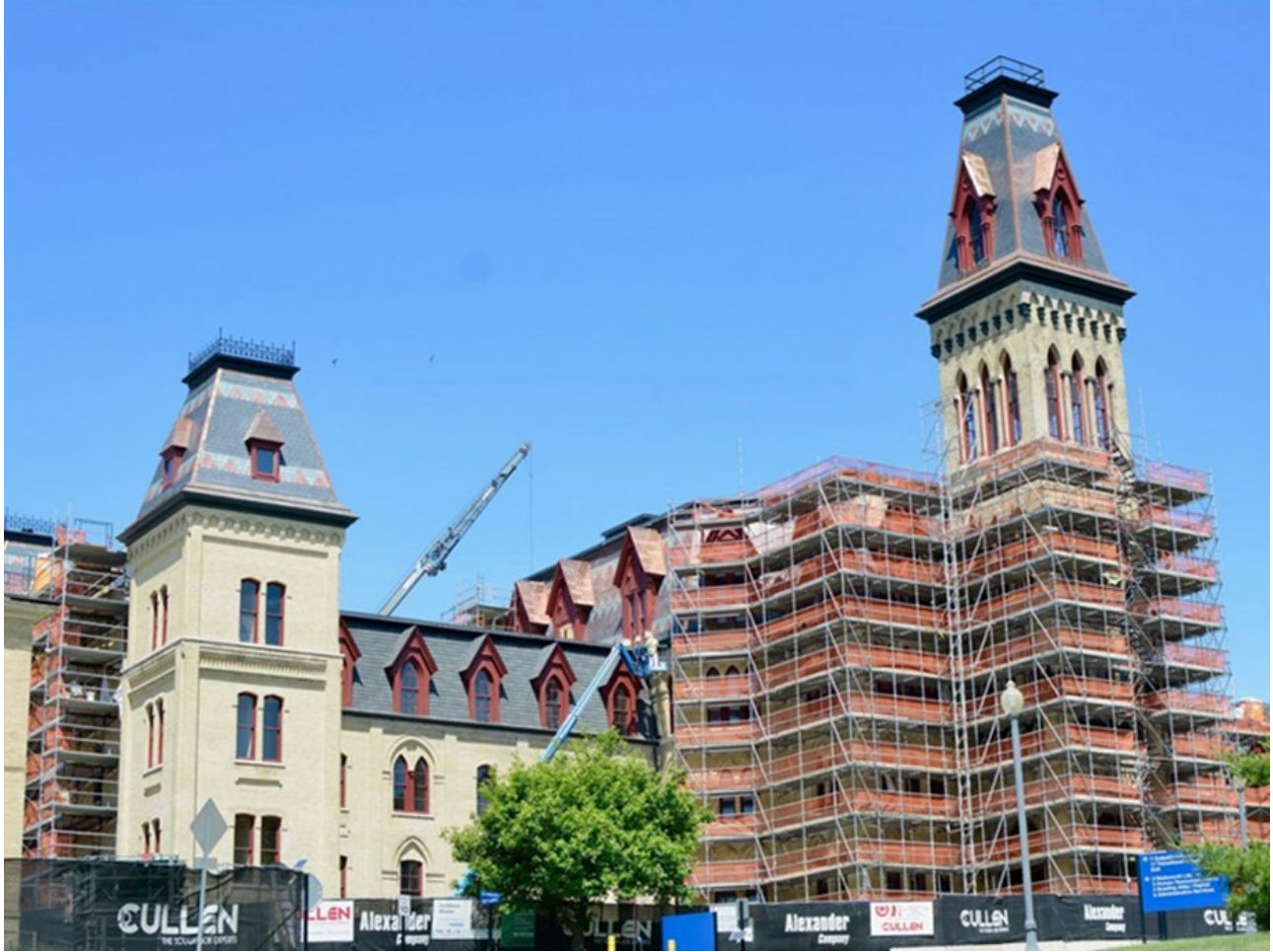
Figure 9: Milwaukee VAMC’s Old Main during rehabilitation.

The Milwaukee Soldiers Home welcomed its first residents in March 2021 after an 18-month renovation project, which was the culmination of a 10-year effort to save several historic buildings and return them to their original purpose – serving Veterans. This EUL project, which involves the adaptive reuse of six historic buildings on the campus into 101 housing units for homeless and at-risk Veterans and their families, was also awarded a $500,000 Save America’s Treasures grant from the National Park Service