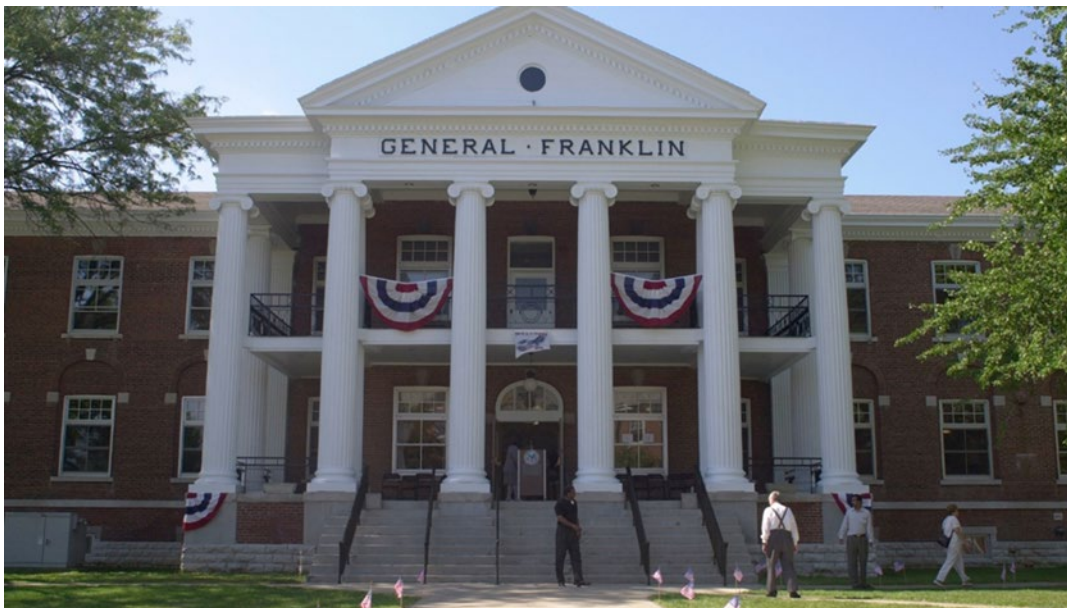
Figure 11: Building 412 at Dayton after project completion, 2021.