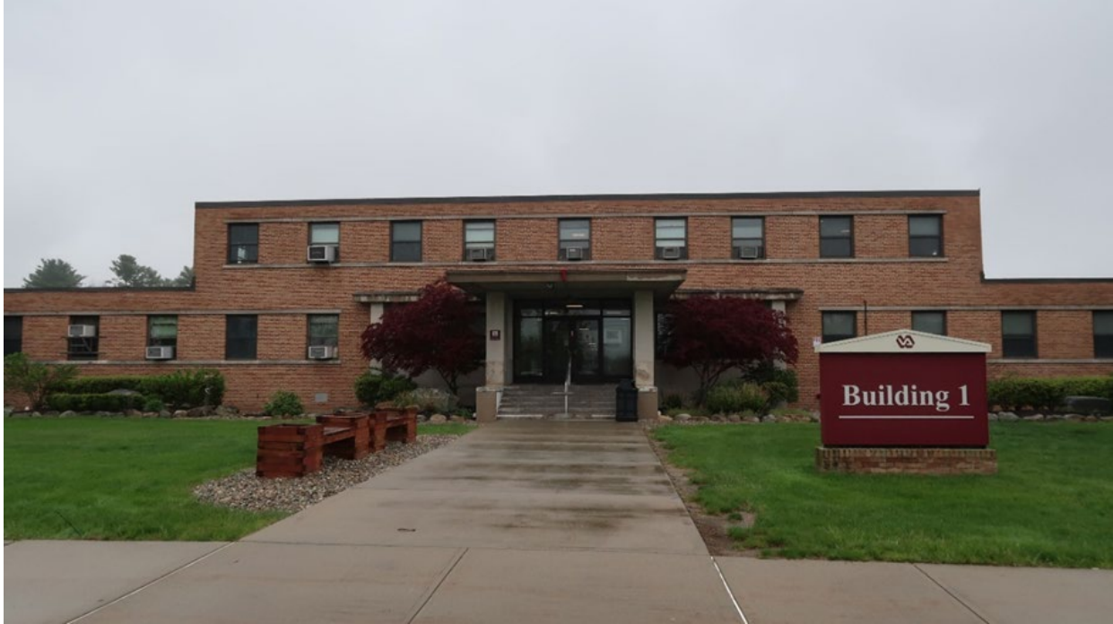
Figure 1: Building 1 at the Brockton, MA VAMC, which was listed on the NRHP in 2022.

VA completed nine determinations of eligibility for VAMCs, which SHPOs or the Keeper of the NRHP have concurred are not eligible: