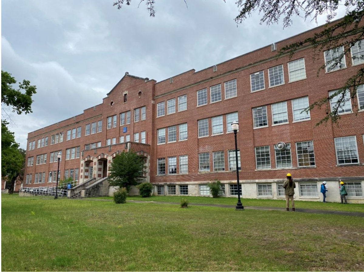
Figure 2: Building 62 at the Tuskegee VAMC. HPO and NPS employees completed an initial site visit in May 2023 in support of the NHL Study.