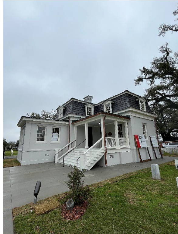
Figure 7: View of the Mobile (AL) National Cemetery lodge.

In March 2023, NCA entered into an agreement with Richmond National Battlefield Park to develop ranger-led tours and brochures for Glendale and Richmond national cemeteries. These tours and brochures are scheduled to be available in the summer of 2023.