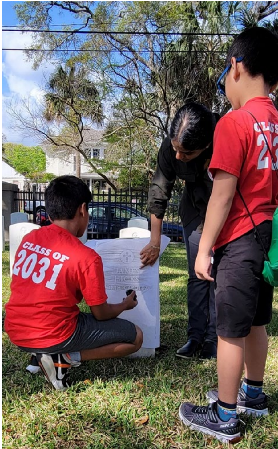
Figure 8: Students learn more about the lives of African American WWI soldiers during the UCF VLP program at St. Augustine National Cemetery.