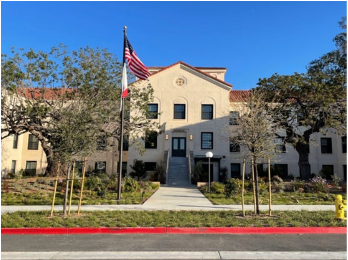
Figure 12: Building 207 at West Los Angeles, after project completion.

During the reporting period, the VA Greater Los Angeles Healthcare System (VAGLAHS) West Los Angeles Campus has activated a series of EULs. VA has completed projects in Buildings 205, 207, 208, which are all contributing buildings to the West Los Angeles NRHP district. All three buildings, which had been vacant, now provide more than 179 housing units for Veterans. Together with Building 209, which opened in 2017, there are now 233 housing units for Veterans in historic buildings on the campus.