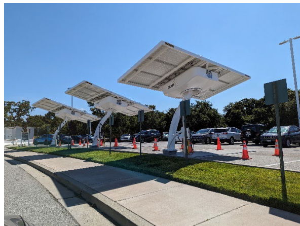
Figure 4: EV charging stations at the Palo Alto (CA) VAMC.

electric vehicle supply equipment (EVSE) on historic properties. VA has utilized this exemption on approximately 40 VHA facilities to place approximately 140 temporary, free-standing, mobile EVSE units in parking areas, allowing for a more streamlined rollout of efforts to focus on clean energy and infrastructure.