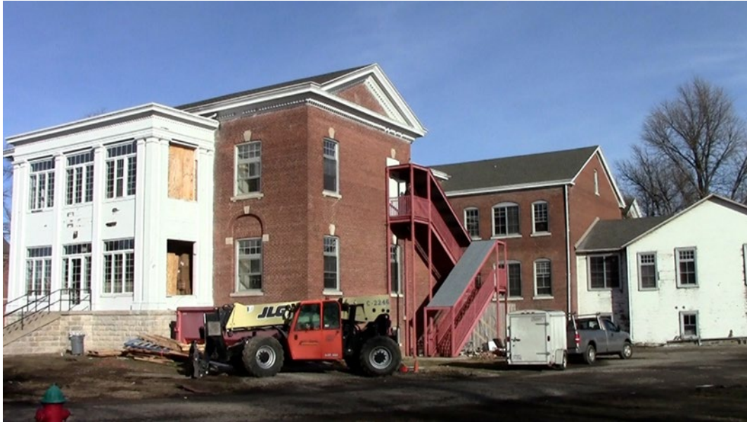
Figure 10: Rehabilitation work on the Dayton, OH Building 412 EUL.

Phase two of this project, which was completed in December 2021, involved the renovation and reconfiguration of 34 existing units into 38 permanent housing units.