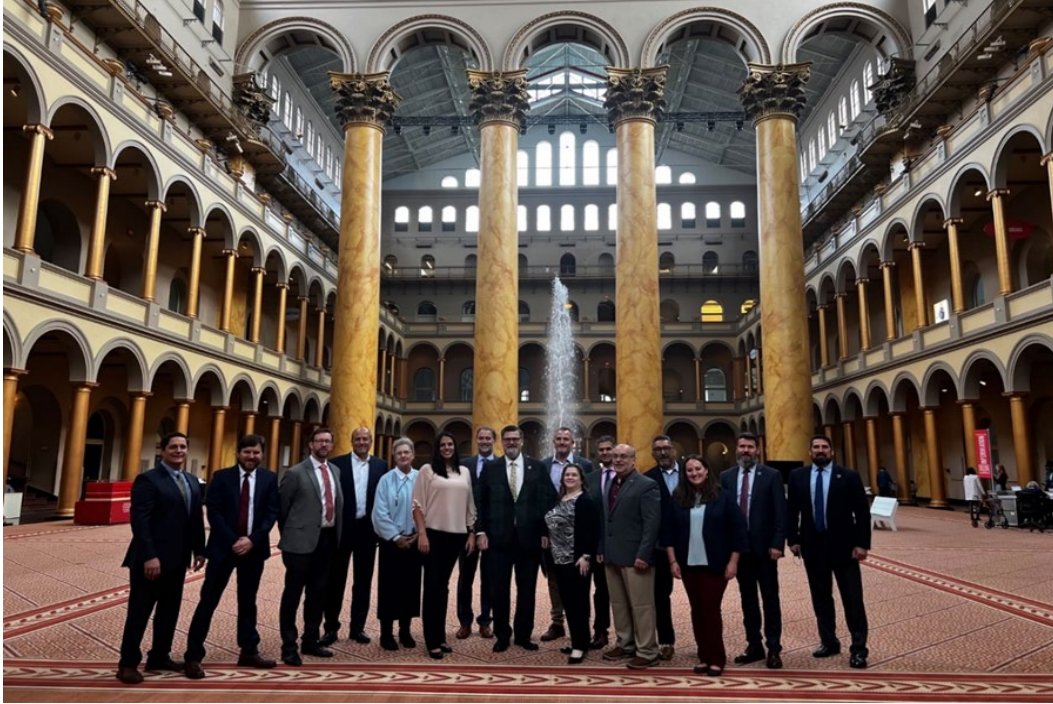
Figure 13: CFM leadership and HPO staff at the National Building Museum, formerly the Old Pension Office.

VA has continued its partnership with the ACHP, sponsoring a liaison program analyst position since 2010. The VA liaison assists VA in compliance with Section 106 consultations, and in VA's responsibilities as a member of the ACHP.