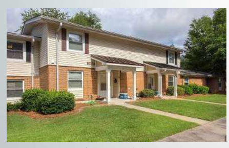
Fort Jackson, SC - 1972