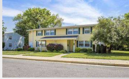
Fort Detrick, MD - 1965