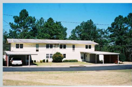
Fort Gordon, GA - 1966