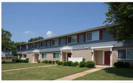
Fort Benning, GA - 1969