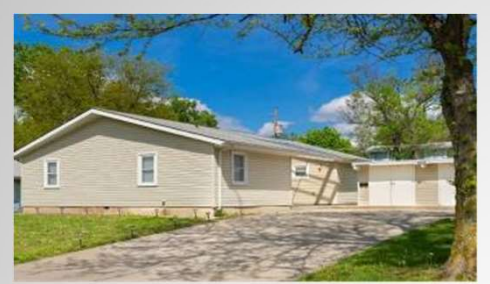
Fort Riley KS - 1963