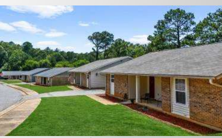
Fort Benning, GA – 1975