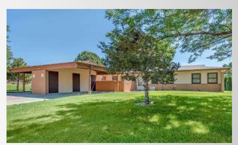
Fort Carson, CO - 1970