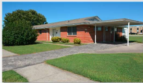
Fort Campbell, TN - 1963