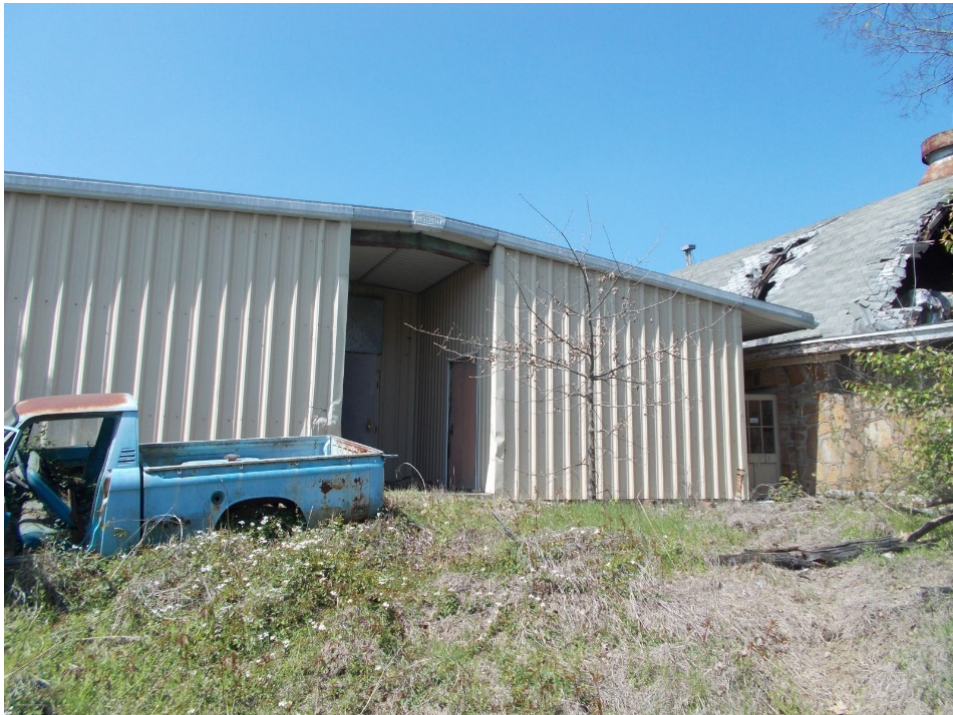
Building 176 façade, camera looking northwest