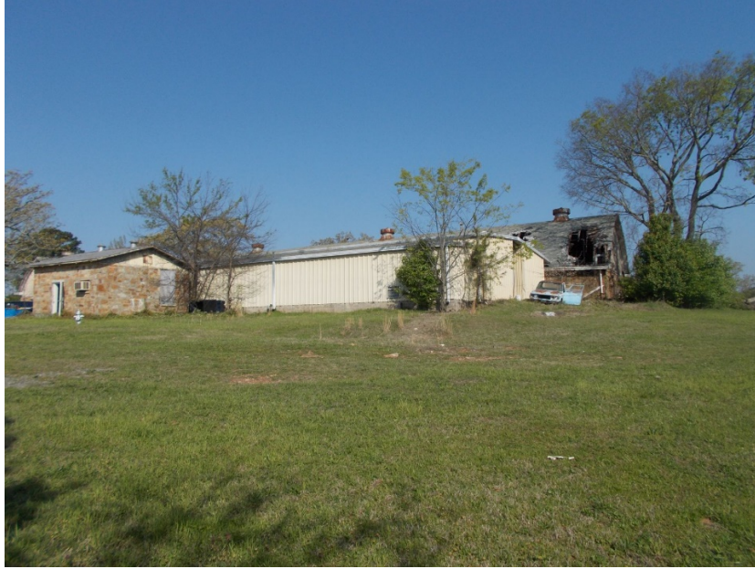
(From left) Building 162, Building 176, and Building 75 (rear)