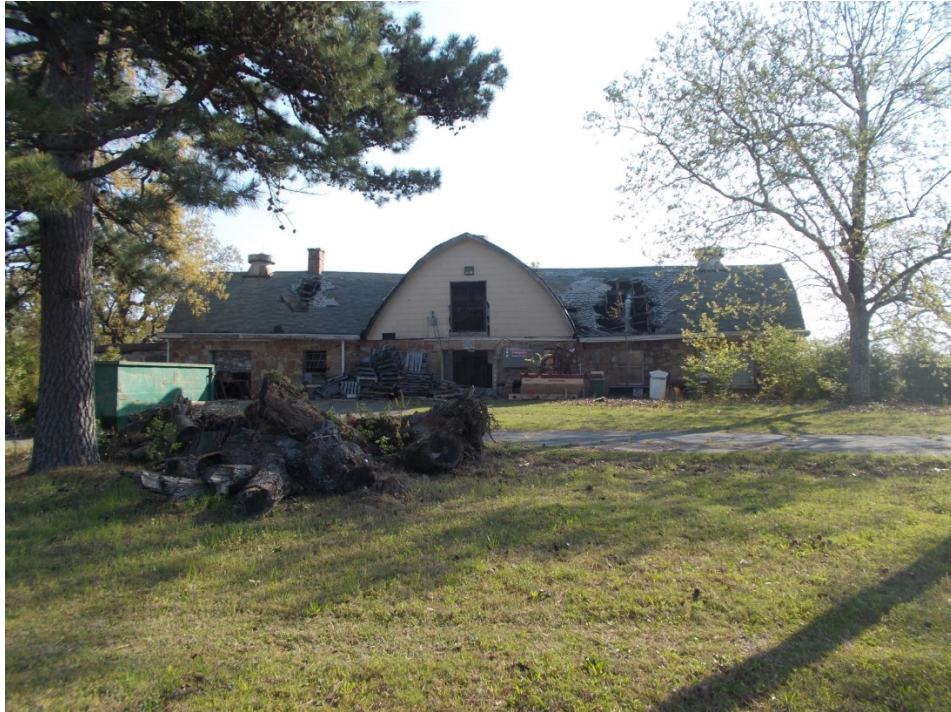
Building 75 façade, camera looking east