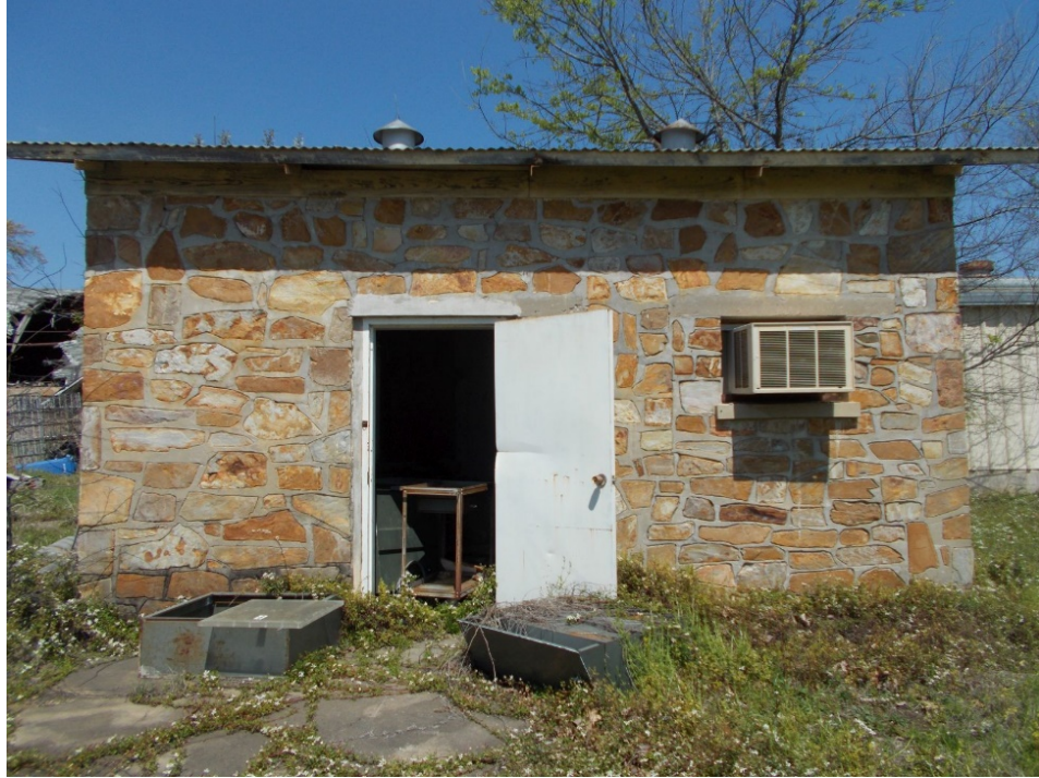
Building 162 façade, camera looking northwest