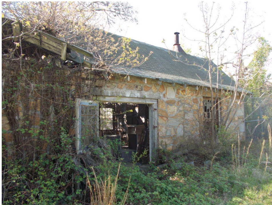
Building 158 façade, camera looking southwest