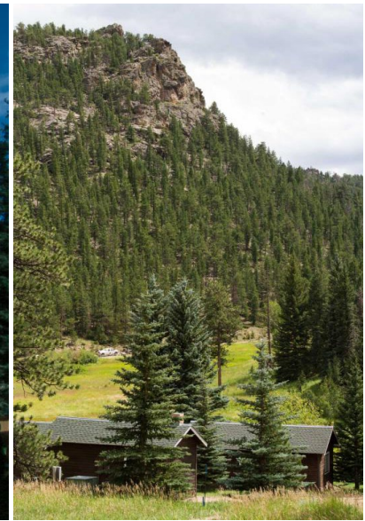
Photos: Above, the house after restoration; Right, mountain view; Partners in Preservation park sign

research facility as a possible alternative, but funding the building rehabilitations became an issue. In December 1994, the NPS, ACHP, RMNP, and the Colorado State Historic Preservation Officer entered into a Memorandum of Agreement (MOA) to document the structures, interpret the property for visitors, and demolish a later infill cabin. The MOA also included a stipulation that the historic structures would be preserved, provided funding for their rehabilitation and maintenance was raised within three years of the execution of the agreement. According to the MOA, if the funding targets were not met, RMNP would remove all structures, leave the building footprints, and make the area suitable for elk. Recognizing the value of the project, RMNP committed funds for the infrastructure improvements, and the private fund-raising effort was successful. Today, McGraw Ranch has become an important NPS research center, with overnight accommodations, a small lab, kitchen facilities, and work space for researchers. While not open to the public, the history of the ranch is interpreted for visitors.