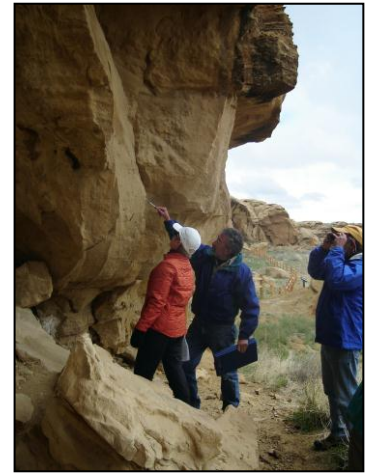
New Mexico SiteWatch volunteers record archaeological remains