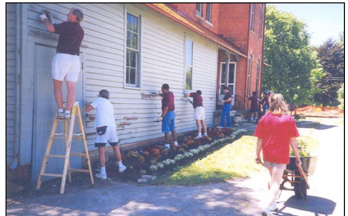
Volunteers work to preserve the Oberlin Heritage Center